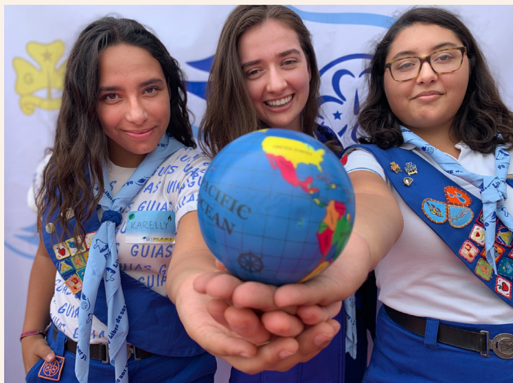
Western Hemisphere Region

There is unlimited potential in every girl- to lead, learn, innovate and make change. Yet across the world women and girls face barriers, discrimination and inequality holds them back.