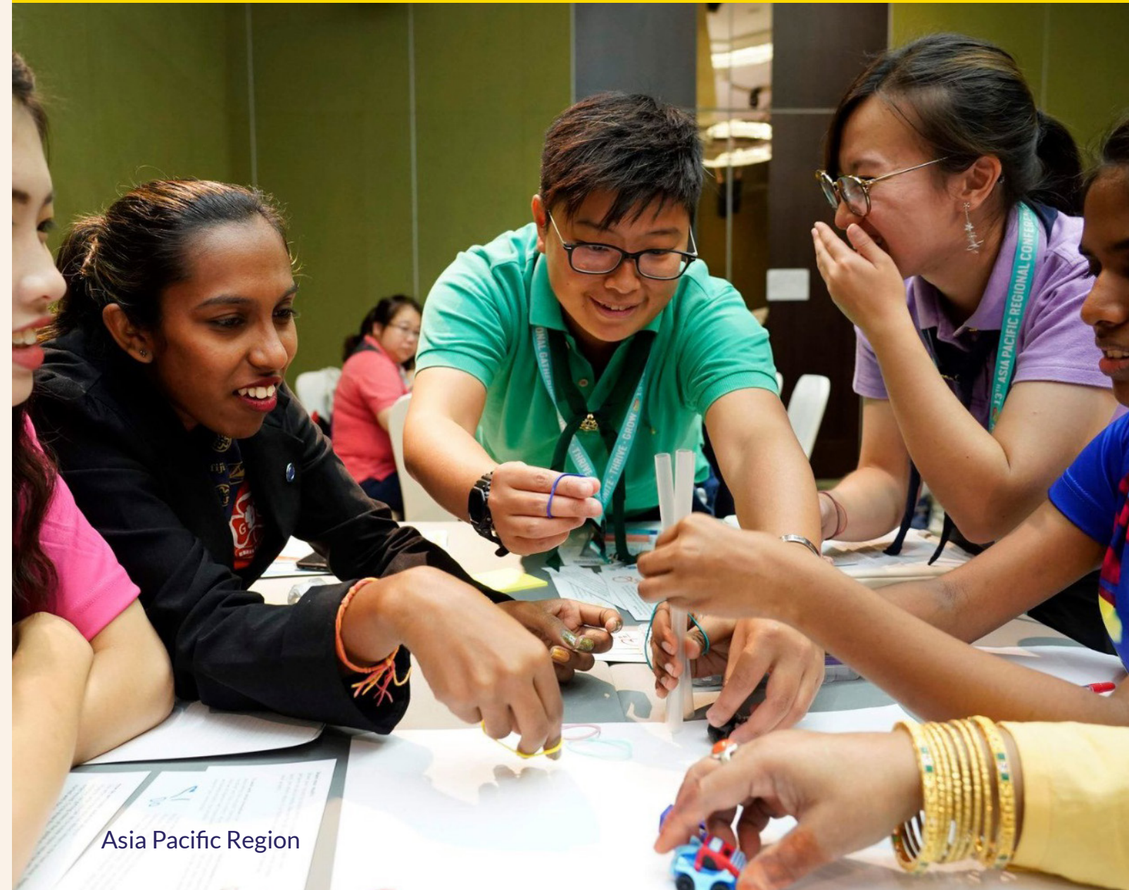
Asia Pacific Region

Our fundraising provides opportunities for members to experience and develop leadership through a variety of programmes and activities.