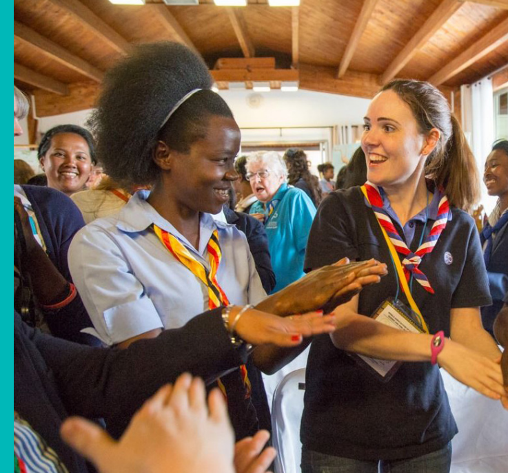
Arts4Change, Kusafiri World Centre, Madagascar