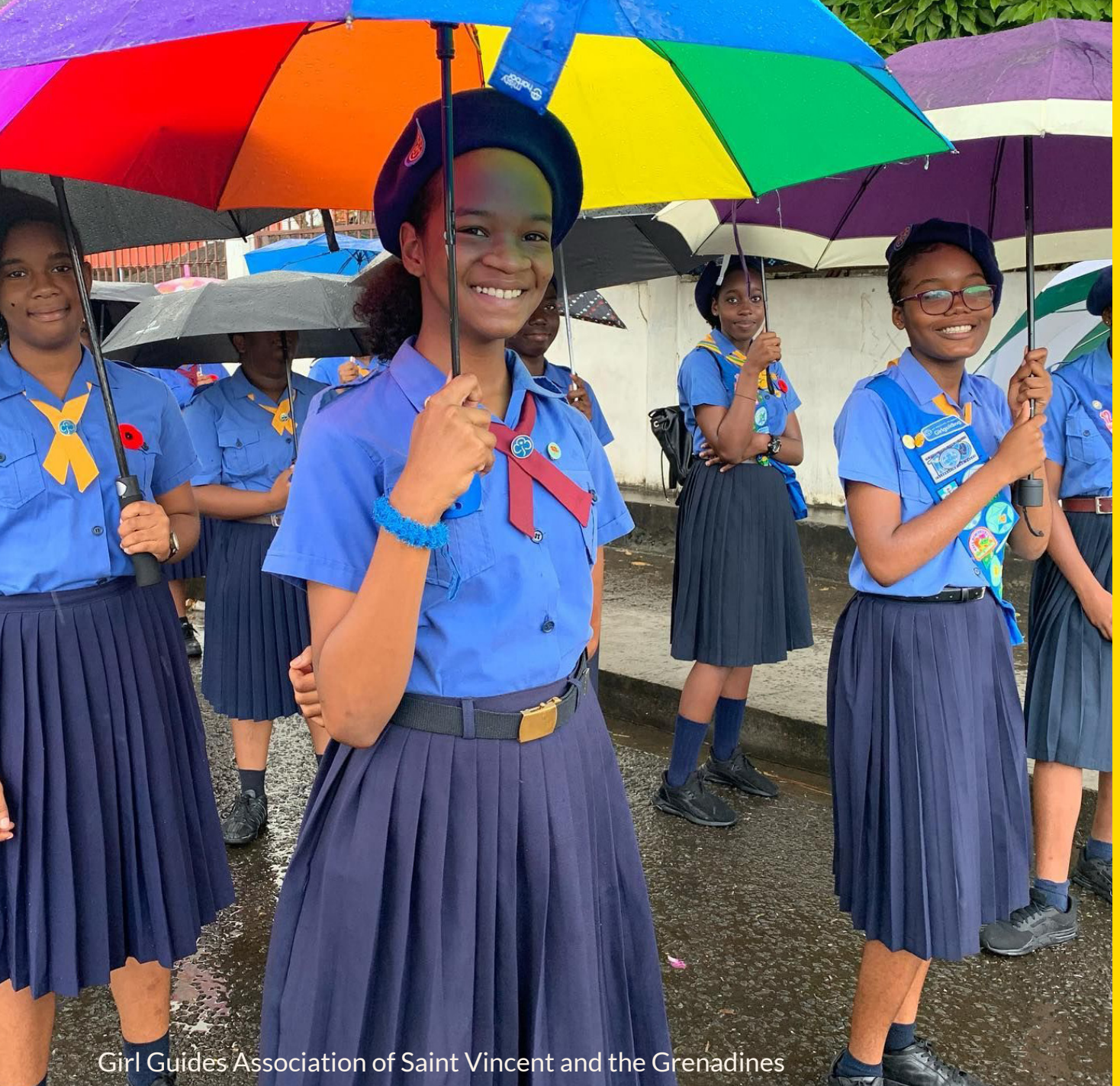
Girl Guides Association of Saint Vincent and the Grenadines