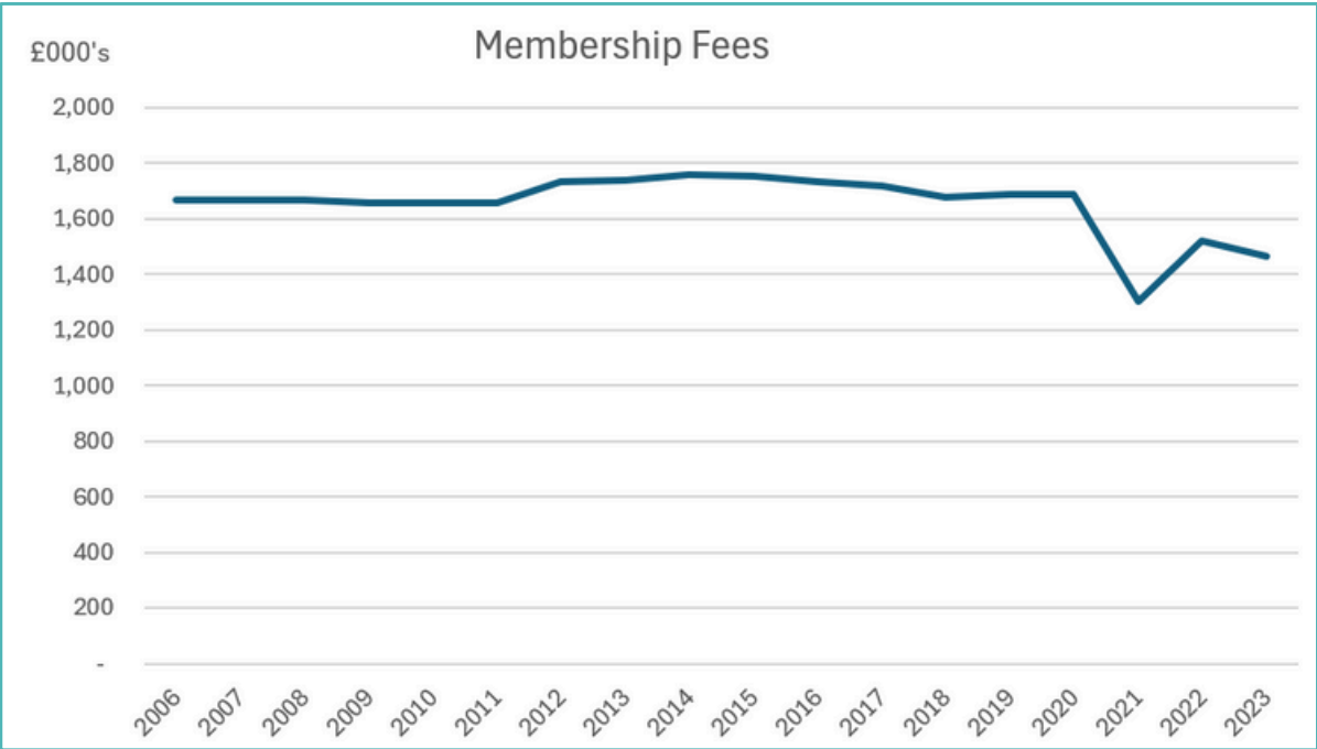
Chart 1: Membership Fees from 2006 to 2023 [1]

As shown in Chart 2, membership fee income (except for the global pandemic years) has delivered between 30 to 40 per cent of WAGGGS's total unrestricted income. During the global pandemic years, this increased to closer to 50 per cent, primarily due to the loss of World Centre income.