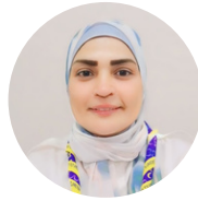
Mona Khalifa Egypt